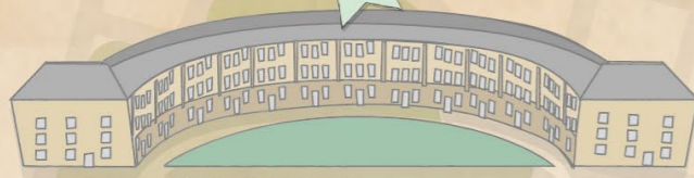
The Royal Crescent