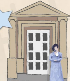
The Jane Austen Centre

Read a book, play or poem that is written about an author who has lived in Bath