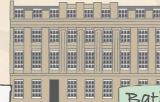
Bath Royal Literary & Scientific Institution

to: Fairfield House Locksbrook Campus Newton Park Campus