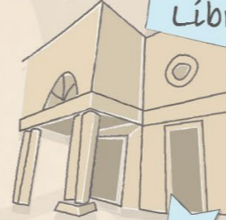
Bath Central Library